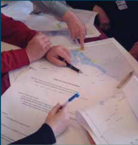
Regional Hub members get to grips with the maps and data at the Scarborough meeting.

The Net Gain Project has been set up to identify and recommend potential sites for Marine Conservation Zones (MCZs) in the English North Sea. The Net Gain process is different from other similar projects in that it aims to involve all those who have an interest in the North Sea and its future from the start, from large scale fisheries and aggregates to divers and wildlife enthusiasts.